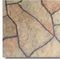
San Diego Flagstone