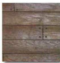
Random Boardwalk 6" Planks*