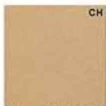
623 Arizona Buff