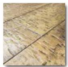
Hand Hewn Timber