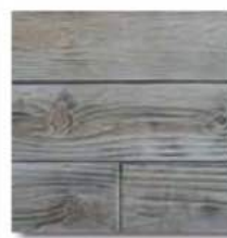
Boardwalk 6" with knots*