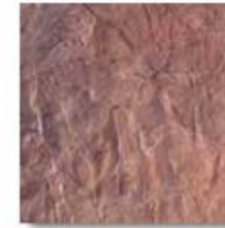
Seamless Italian Slate*