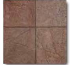
18 x 18 Old Granite Stacked Tile