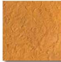
Seamless Sandstone Light