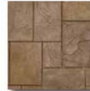
Ashlar Roman Slate*