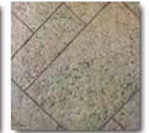
Connors Quarry Stone