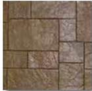
Rotating Ashlar Roman Slate