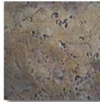
Seamless Travertine Course Groutable