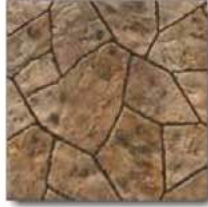
Random Blue Stone*