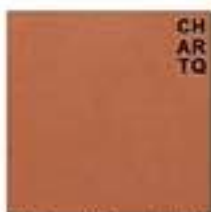
626 Georgia Clay