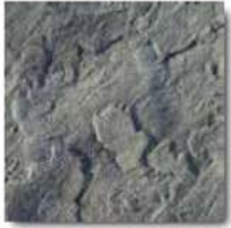
Seamless Blue Stone