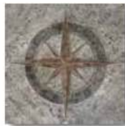
Old World Compass