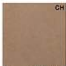
632 Saddle Soap