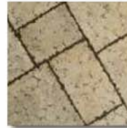
Versailles Tumbled Travertine