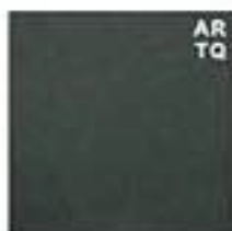
615 Midnight Gray