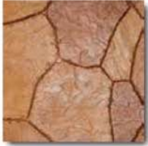
Santa Fe Random Stone Medium