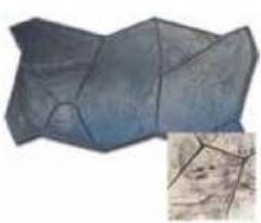
Large Random Flagstone