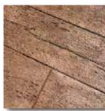
Reclaimed Timber Planks