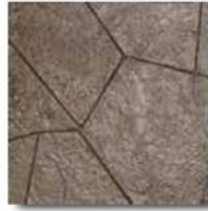
Random Old Granite