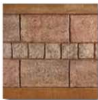
Bellagio Custom Band Tool