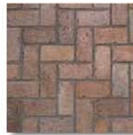
Herringbone Used Brick*