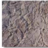
Seamless Roman Slate*