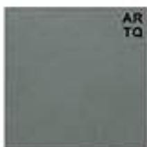
613 Soft Gray