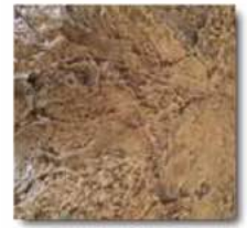
Seamless Blue Ridge*