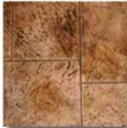
Ashlar York Stone