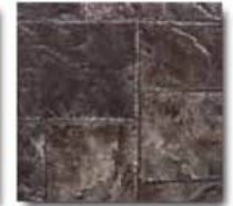
Ashlar Grand Blue Stone