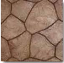
Random Sandstone Hammered Edge*