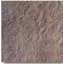
Seamless Flamed Granite