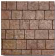
Cut Stone Cobble