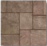
Ashlar New England Slate

* Stamps noted with a star are available at both the Carrollton & Fort Worth stores