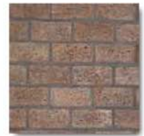
Running Bond Used Brick