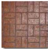
Basketweave Used Brick