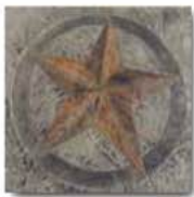
5 Point Star*