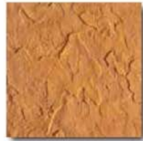
Seamless Sandstone Coarse