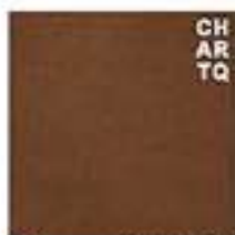
629 Terra Cotta