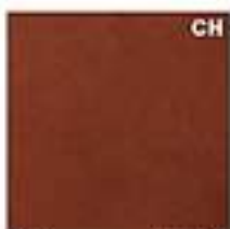
638 Tile Red