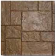
Rotating Ashlar Blue Stone