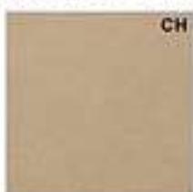
603 Sand Canyon