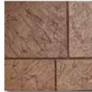
Large Ashlar New England Slate Groutable*