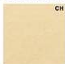
601 Cream Buff

COLOR HARDENER = CH // ANTIQUE RELEASE AGENT = AR // EZ-TIQUE ANTIQUE COLOR WASH = TQ