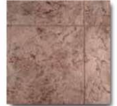
24 x 24 Roman Slate Tile