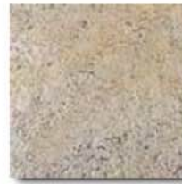
Seamless Quarry Stone