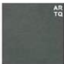
614 Rock Gray