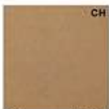
625 El Paso