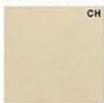
602 Adobe Beige