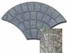
Old London Mermaid Granite